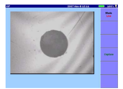
Clean optical connectors ensure your network is operating to its potential.

Connector images are captured digitally and displayed on the test set screen. The images can then be viewed or saved as a variety of common graphics files for later review or documentation of connector quality. Various adapters are available to allow direct viewing of patch cord end faces, as well as, for viewing of end faces already installed in patch panels. Furthermore, since there is no path to the human eye the VIP application eliminates the possibility of injury as with traditional connector microscopes.